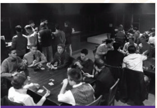
Undergraduate brothers enjoying and evening of poker at the Lodge

We have 27 Brothers living in the Lodge this semester and anticipate sustaining live-in numbers in the mid 30's for the foreseeable future. As I explained the value of living in to potential new members during the recruitment period, I found myself realizing the extent to which living in the Lodge has enriched my college experience and brought me closer to the Brothers with whom I have lived. I look forward to the capital campaign bestowing upon the Lodge an environment in which this tradition may thrive for decades to come.