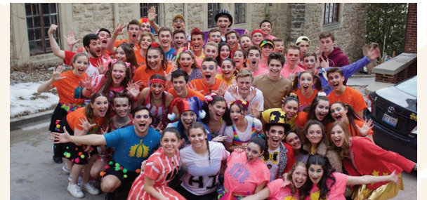
Our undergraduate Brothers took home their second straight Humorology title and raised a record $53,000 for the Neighborhood House alongside Alpha Epsilon Phi and Delta Tau Delta.

This is an exciting time for Alpha Iota as the Chi Psi National Convention is coming to Madison this summer. Our current Parents and Alumni Chair,