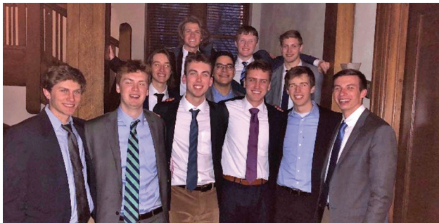
We're proud to welcome our newest group of Brothers, the Spring 2018 Alpha Iota pledge class.