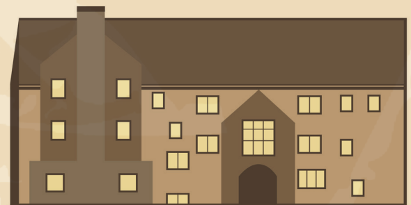
CHI PSI FRATERNITY 177TH ANNUAL CONVENTION MADISON, WI | ALPHA IOTA | JULY 25-28, 2018