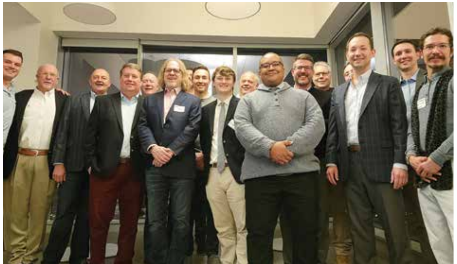
All the Brothers enjoying the 2022 Milwaukee Area Cocktail Reception.