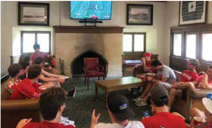
Brothers enjoying Saturday football together!

This past semester at Iota has been a much-welcomed return to a partial state of normalcy. Whether that be tailgates and game days coming back, more opportunities for philanthropy, or just gathering all together in larger groups, I believe I can speak for all of us when I say Fall '21 was a memorable semester. As we approach 2022, we have a lot of exciting things on the radar and are very grateful for all the people who make these things possible.